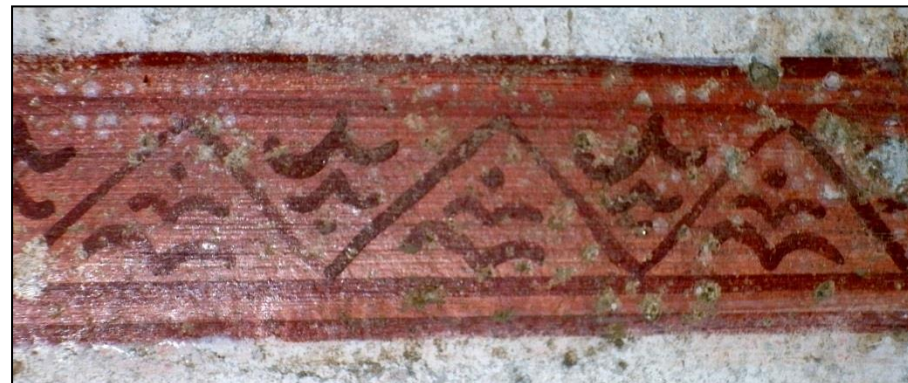
Pattern T9, detail