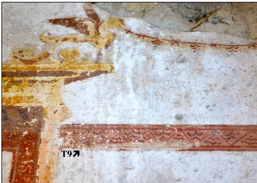
North wall, upper zone, left, pattern T9