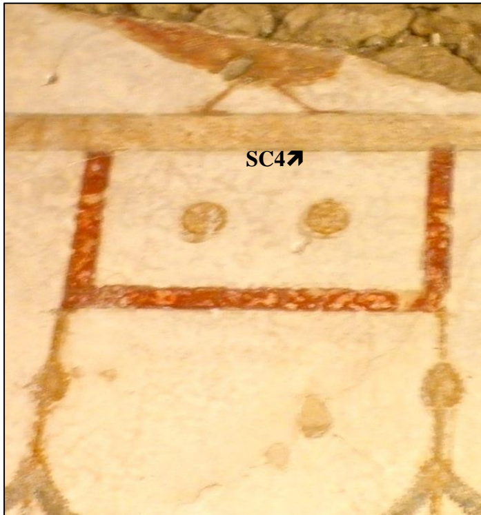
West wall, upper zone, right, pattern SC4