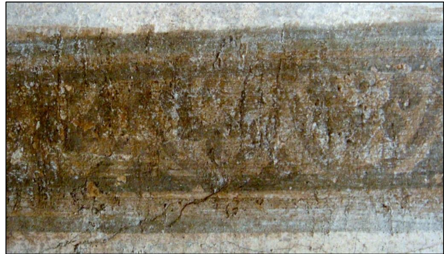
Pattern SC4, detail