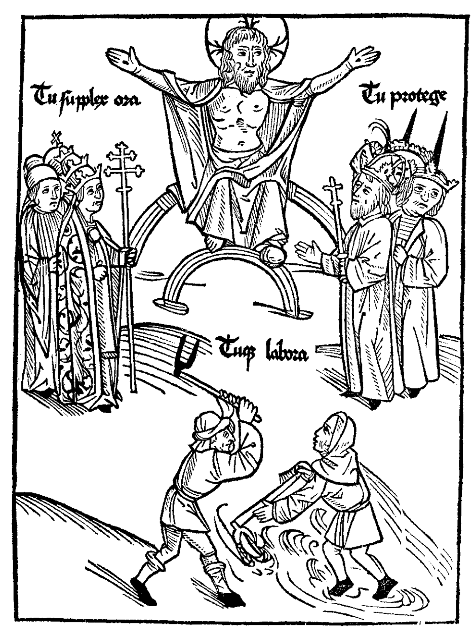
Fig. 5. Christ reigning over the clergy, nobility, and laity in the Prognosticatio .