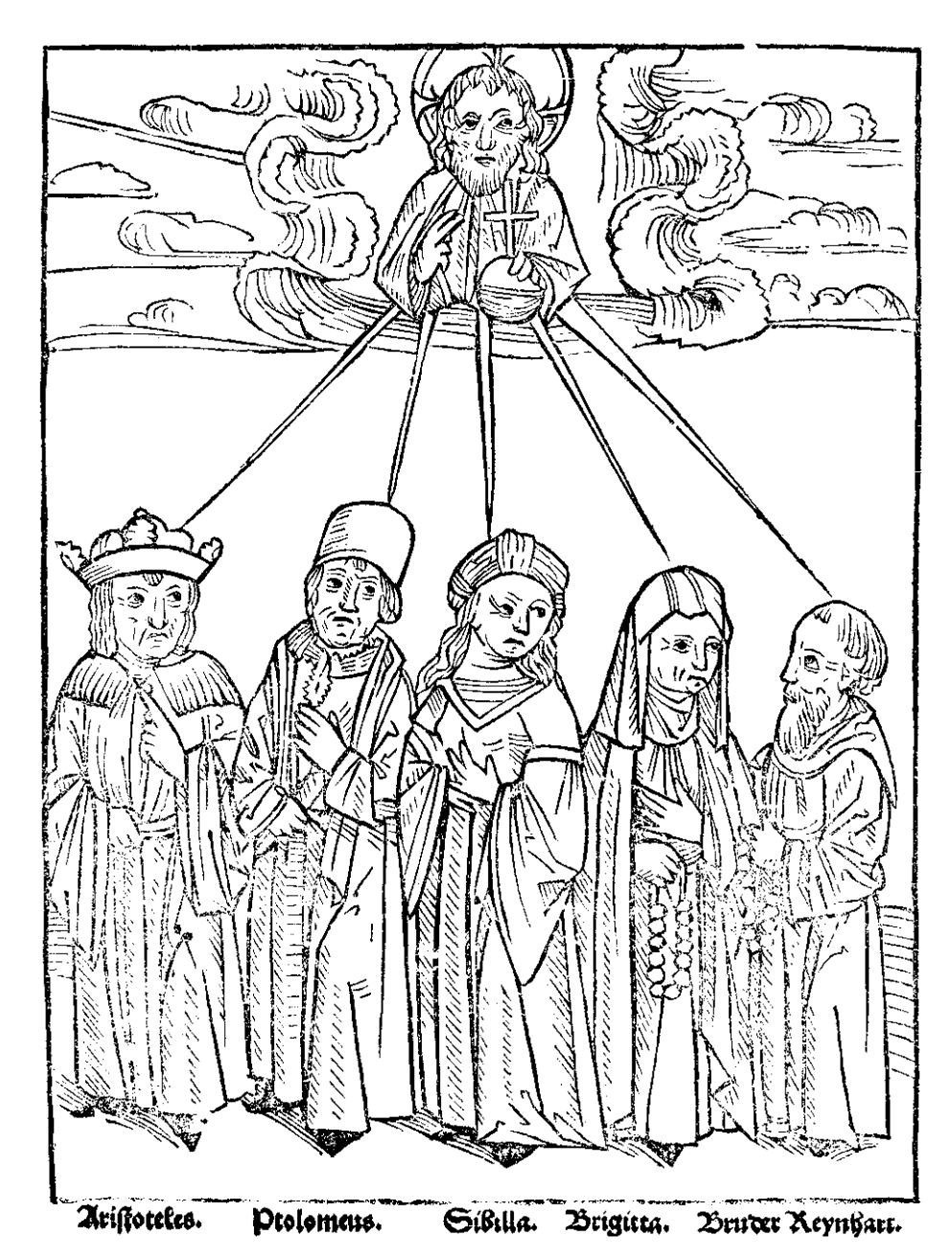
Fig. 3. The first woodcut in the Prognosticatio , in which Lichtenberger's five astrological and prophetic authorities receive inspiration.