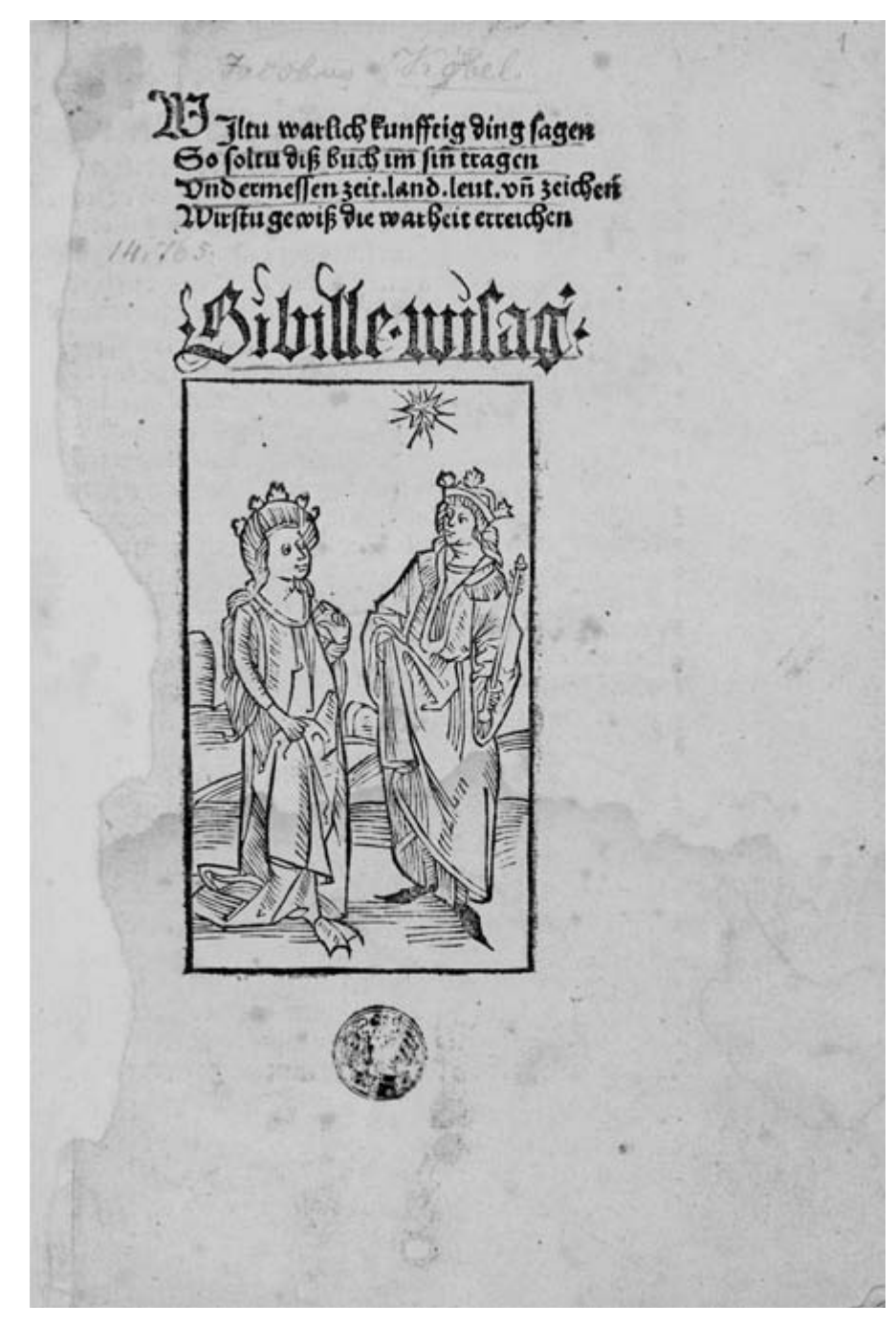
Fig. 2. The Sibyl and Solomon, from the title page of Heinrich Knoblochtzer's edition of the Sibyl's Prophecy , ca. 1492.