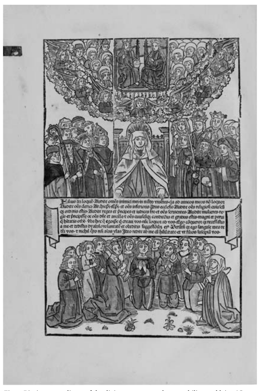
Fig. 6. Birgitta as mediator of the divine message to clergy, nobility, and laity.