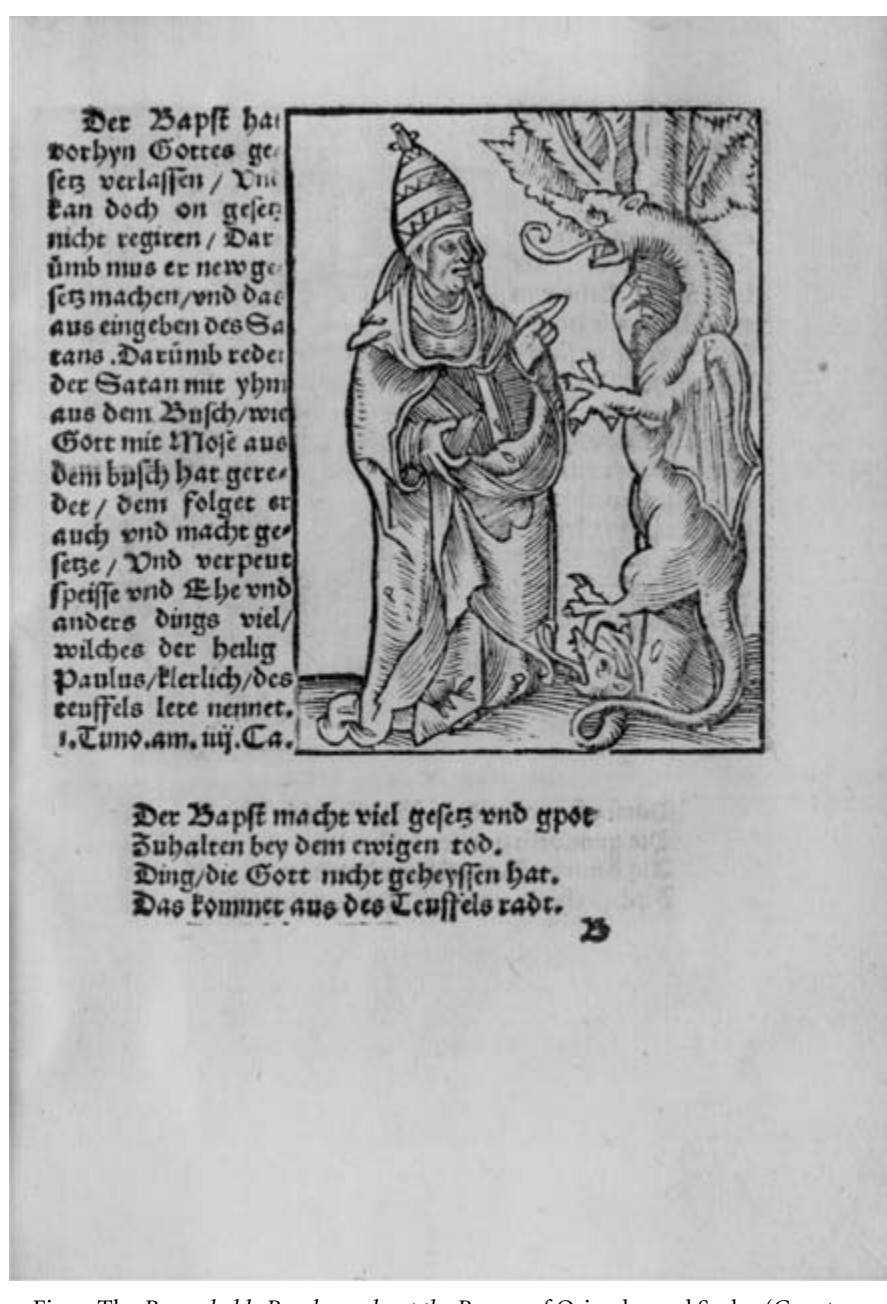
Fig. 9. The Remarkable Prophecy about the Papacy of Osiander and Sachs.