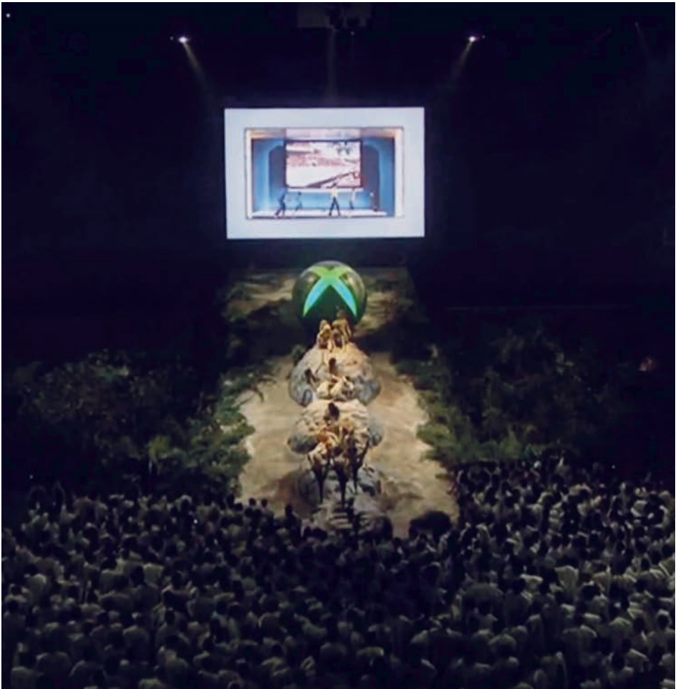
Figure 23. The top third of this screenshot shows the stage, a framed living room in which the members of a family play (or play vicariously) Kinect games. Below the boulder with the Xbox insignia are the Cirque de Soleil natives vicariously playing as they watch the family, while all around and behind them is the E3 audience in their white ponchos. Microsoft launch of Kinect at Electronic Entertainment Expo (E3), Galen Center in Los Angeles (2010). Playbox Games, "Speciale E3—World Premiere of Kinect," YouTube , 7 June 2013, https://www.youtube.com/watch?v=Uzr--8xvvF0 .