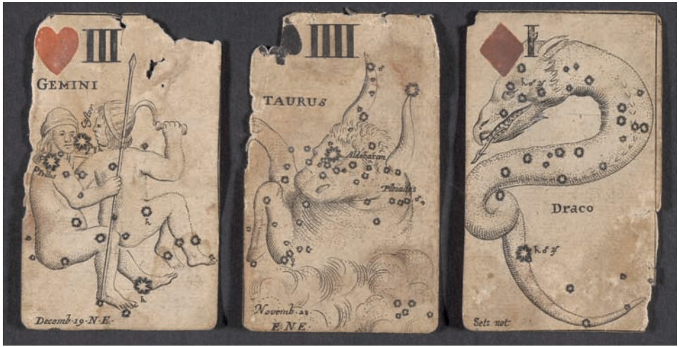
Figure 3. Joseph Moxon, The Use of the Astronomical Playing-Cards (1676).