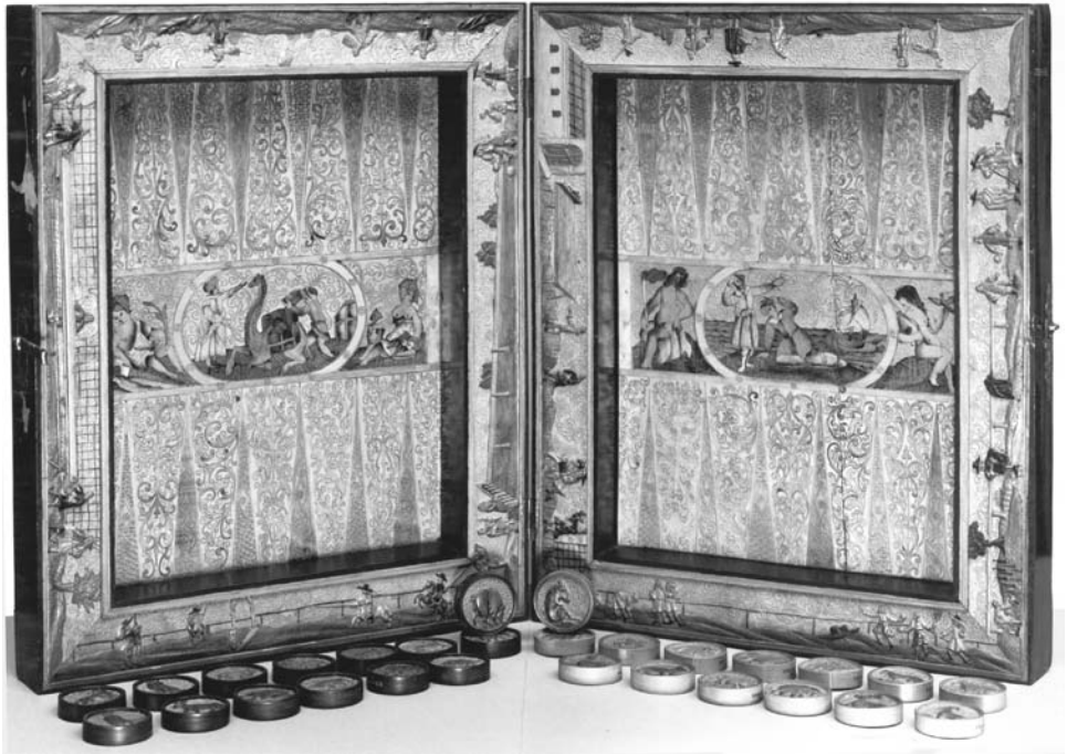
Figure 2. Game board and pieces (1650–1747). Made in England, Netherlands, or Eger.