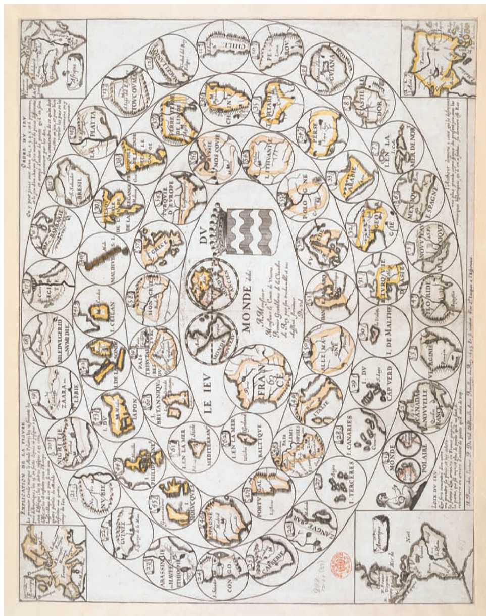
Figure 17. Le jeu du monde (Paris, 1645) by Pierre du Val.