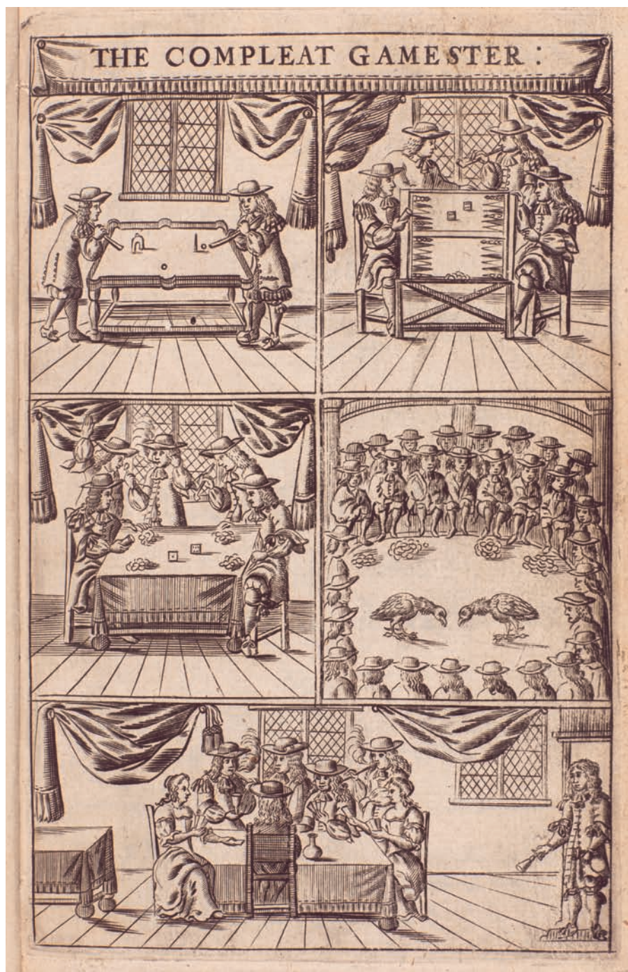
Figure 11. Frontispiece to Charles Cotton, The Compleat Gamester (London, 1674).