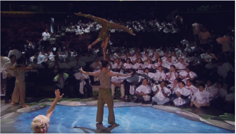
Figure 21. Cirque de Soleil dancers perform physical marvels while the audience, in white ponchos, watches. Microsoft launch of Kinect at Electronic Entertainment Expo (E3), Galen Center in Los Angeles (2010). Screenshot from Playbox Games, "Speciale E3—World Premiere of Kinect," YouTube , 7 June 2013, https://www.youtube.com/watch?v=Uzr--8xvvF0 .