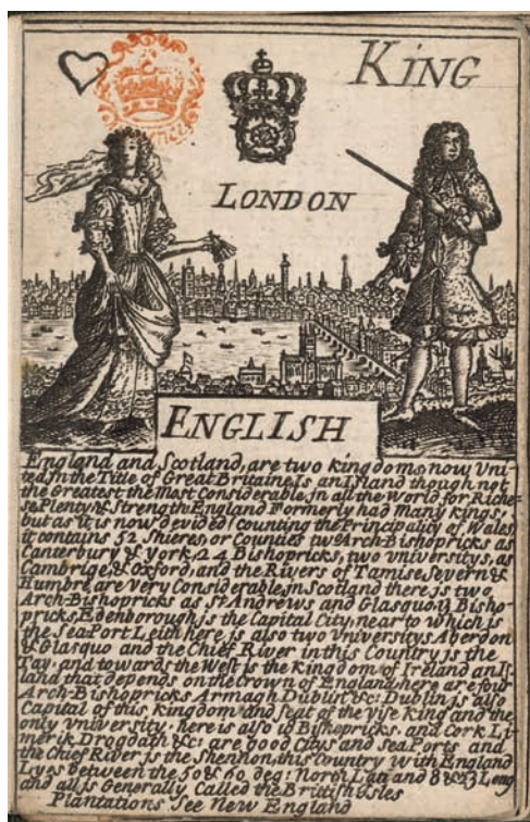
Figure 10. Print; playing card. From the incomplete pack of Henry Winstanley's Geographical Cards of the World (London; 1675–6).