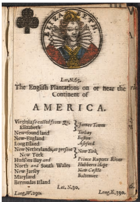
Figure 9. From Geographical Cards (London: F. H. van Hove, 1675).