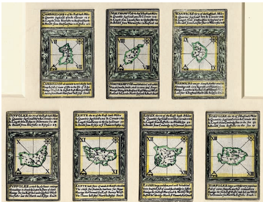
Figure 7. From a complete pack of playing cards, by Augustine Ryther (London, 1590).