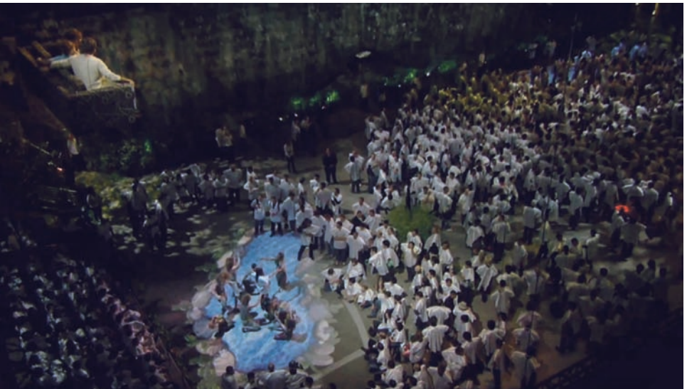
Figure 22. Top left of the screenshot shows actors playing audience members who watch the show from a couch suspended from the arena ceiling. Microsoft launch of Kinect at Electronic Entertainment Expo (E3), Galen Center in Los Angeles (2010). Playbox Games, "Speciale E3—World Premiere of Kinect," YouTube , 7 June 2013, https://www.youtube.com/watch?v=Uzr--8xvvF0 .