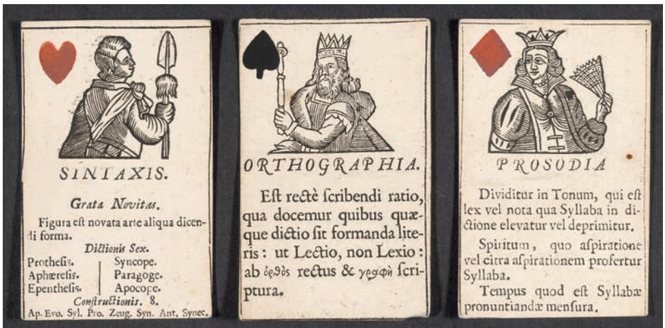
Figure 4. Grammatical Cards (London, 1676).