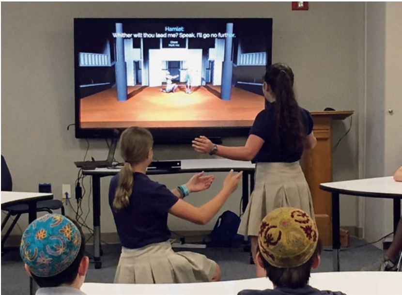
Figure 24. Members of the sixth-grade class at the Epstein School (Atlanta, GA) during an installation of Play the Knave , 4 April 2017.