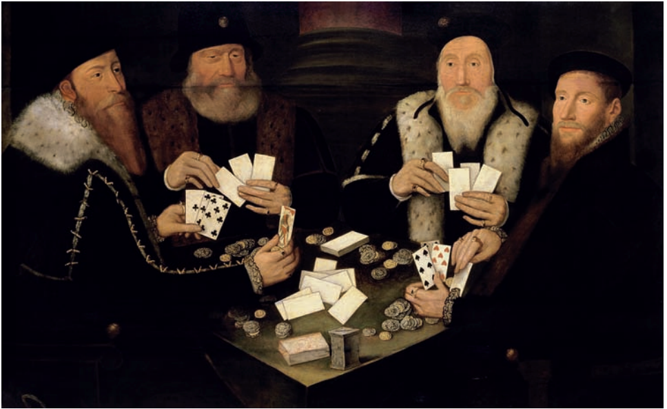
Figure 12. Four Gentlemen of High Rank Playing Primero by Master of the Countess of Warwick (c. 1567–9).