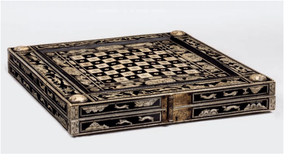
Figure 1. Games board (1581–1600). Made in Germany (probably Augsburg). Ebony and bone.