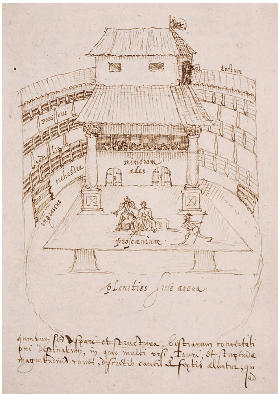
Figure 16. Sketch of the Swan Theatre, after a drawing by Johan de Witt. In Aernout van Buchell, Adversaria , Universiteitsbibliotheek Utrecht, Ms. 842 (7 E 3), fol. 132r (c. 1592–1621).