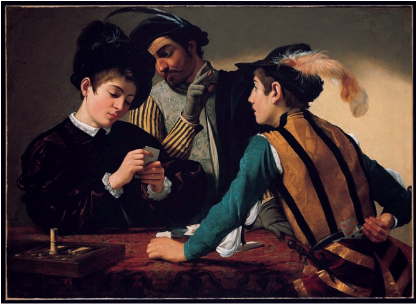
Figure 14. The Cardsharps (c. 1595) by Michelangelo Merisi Caravaggio. Kimbell Art Museum, Fort Worth, Texas, USA/Bridgeman Images.