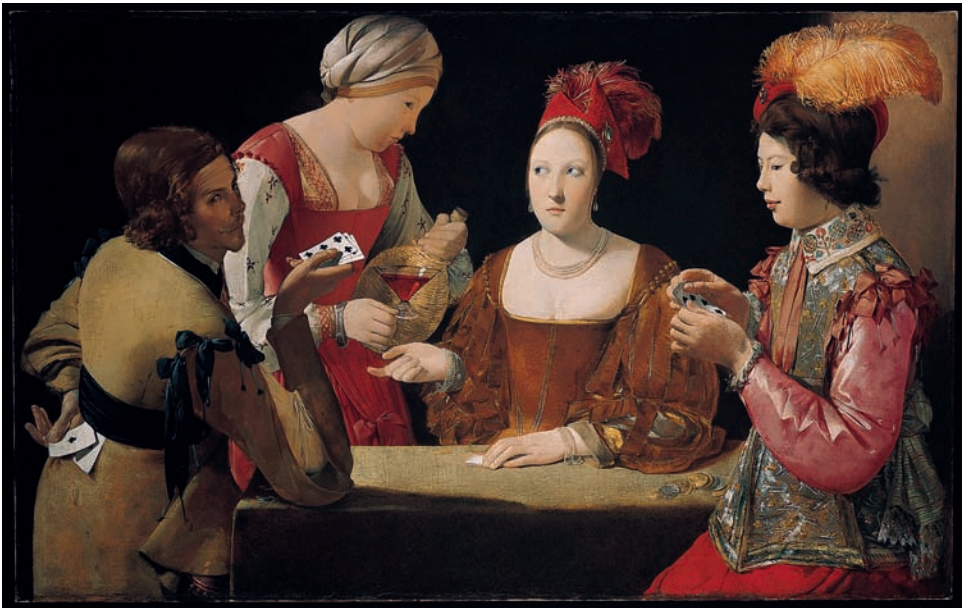
Figure 15. The Cheat with the Ace of Clubs by Georges de la Tour. Kimbell Art Museum, Fort Worth, Texas, USA/Bridgeman Images.