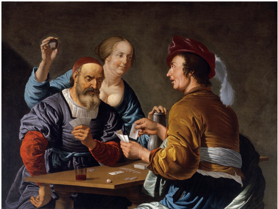
Figure 13. Cardsharps in an Interior (1656) by Aelbert Jansz. van der Schoor. Private collection.