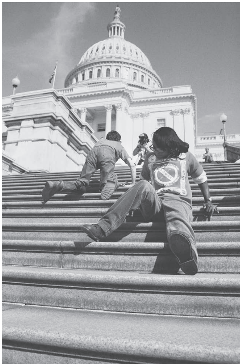
Fig. 2. Tom Olin, “Day in Court for Americans with Disabilities Protests Planned over Supreme Court’s ADA Rulings.” March 1990. Reprinted with permission.