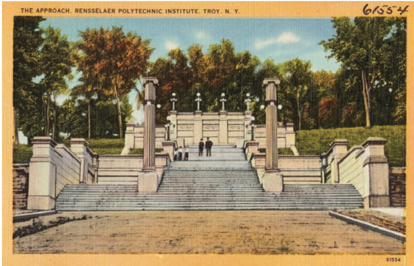
Fig. 1. “Postcard: Approach to Rensselaer.” Rensselaer Polytechnic Institute Library Archives, 1910.

tinue to climb up to an imposing set of gates. Behind these gates there are green trees and foliage and, we assume, the university. Five people stand up near the very top of the steps and they look very small, giving perspective on just how steep and massive the approach is.