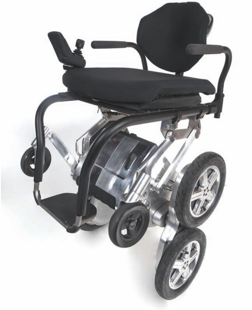
Fig. 4. The iBot Climbing Wheelchair. Toyota Corporation.

Take for example the notion (from a recent Vice article) that we should “Repair Disabilities, Not Sidewalks,” or this image of the iBot Climbing Wheelchair: