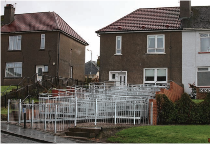
Fig. 5. “Katie Lalley’s Access Ramp.”

As with the example of the “defeat device,” altogether too many retrofits preserve or perpetuate exclusion rather than address it. They are about covering your ass, legally—not about creating anything like real access.